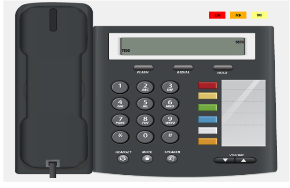
Figure 2 Caller